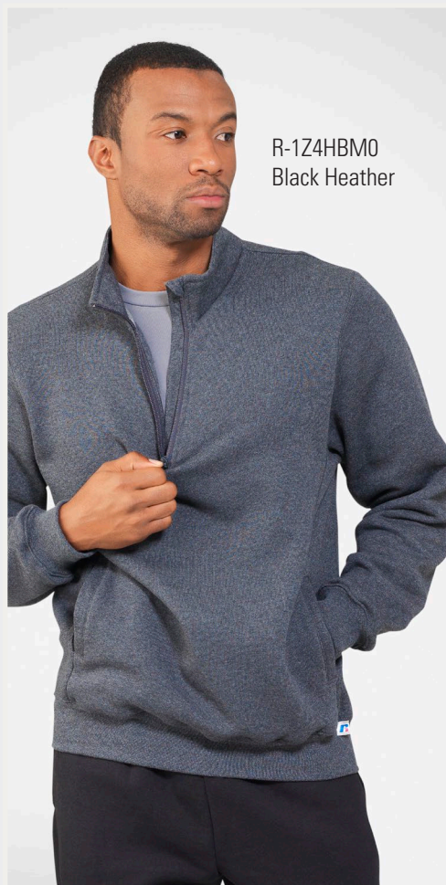
R-1Z4HBM0 Black Heather